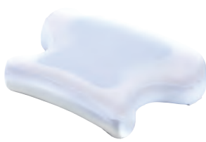
Cooling Pillow Cover