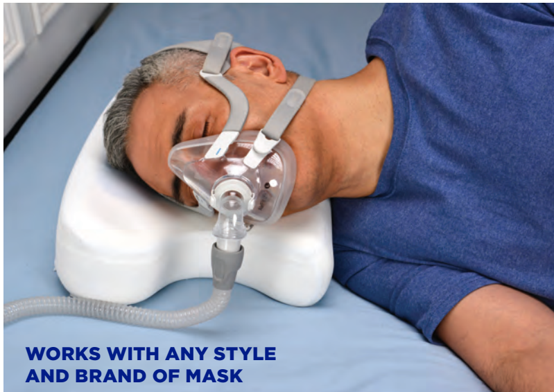
WORKS WITH ANY STYLE AND BRAND OF MASK